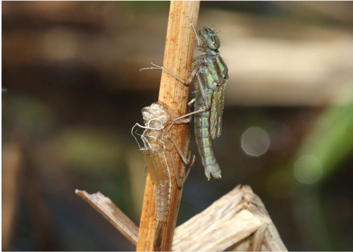
Pyrrhosoma nymphula female emergence, Rowen, 6 th May 2013.