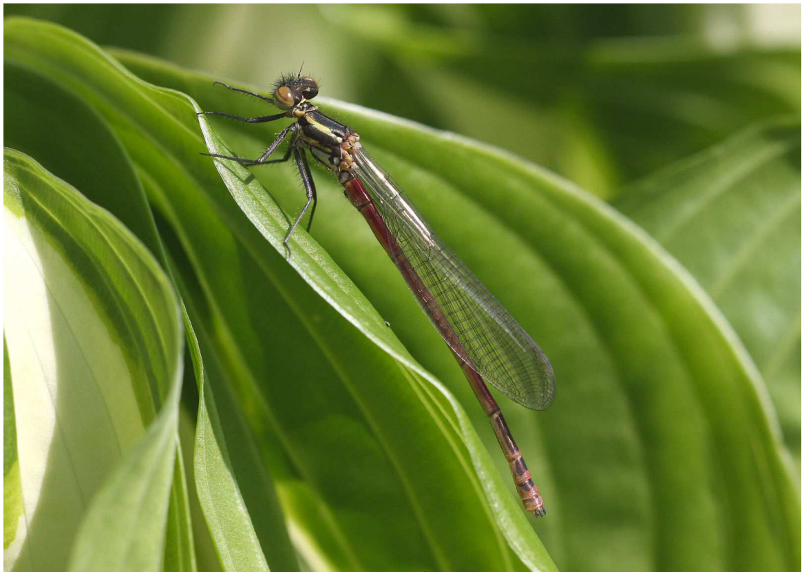
Pyrrhosoma nymphula teneral male, Rowen, 6 th May 2013. Its bright red coloration will develop later as in Eifion's photo below.