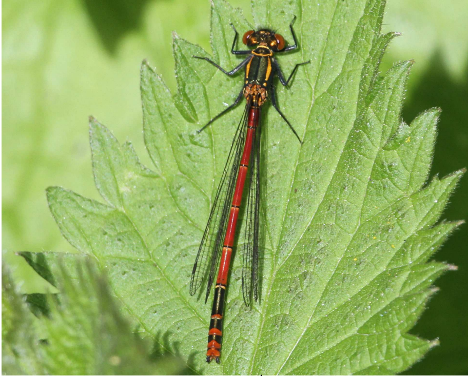
Mature male P. nymphula , Rhuddlan NR, 6 th May 2013 (Photo Eifion Griffiths).